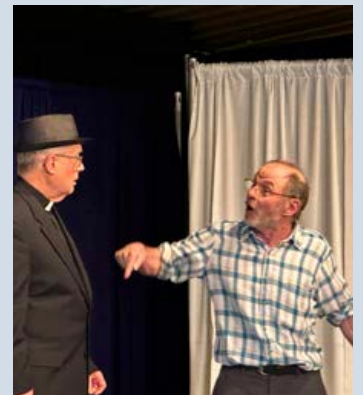
Two scenes from the 2023 play "In Himmel wänd alli"