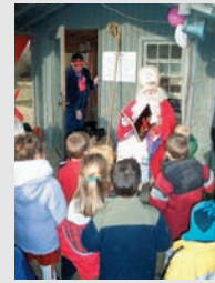
Santa is coming to town!

The schedule for 2009: February 21 st , Raclette Evening, August 1 st , Swiss National Holiday Celebration, October 10 th , "Jass" Tournament, November 7 th , Annual Meeting and Dinner, December 7 th , Santa Claus. We are all looking forward to seeing you at one of our events