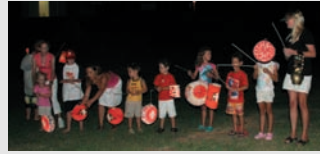
August 1st Lampion Parade

The Swiss Society of Charlotte is in existence for over 20 years by now and we are enjoying a steady membership of close to 100 people. Our activities are mainly based on Swiss traditions