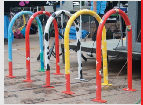
The merrily decorated bicycle racks