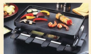
8-Pan Rectangular Raclette Grill

102 Fifth Avenue, P.O. Box 156, New Glarus WI 53574 • (608) 527-2417