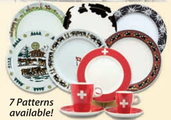
7 Patterns available!