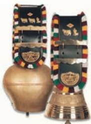
Swiss Cow Bells