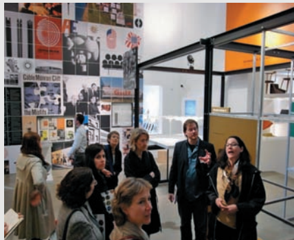
The group visiting a design exhibition