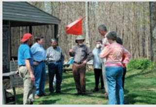
Some of the attendees enjoying the outdoors