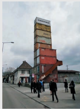
Art and design in Switzerland