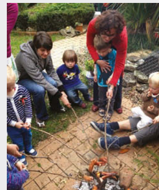
Children & parents grilling servelat am Spies at our August Playgroup!