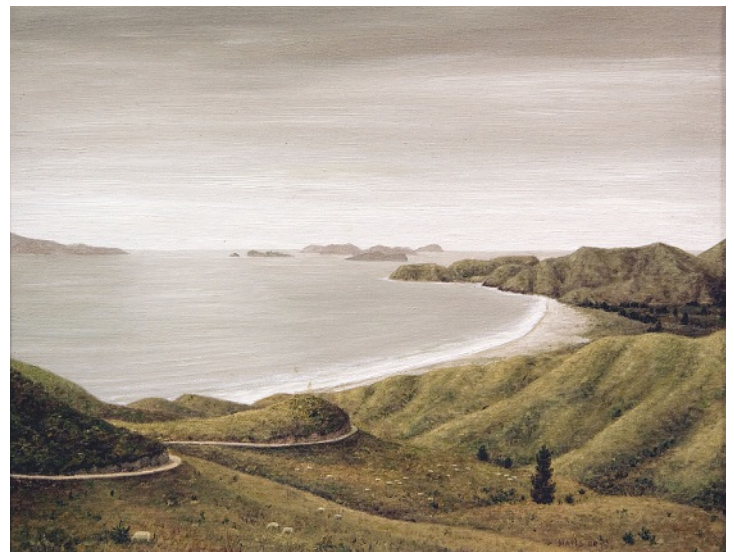
Mercury Island. Oil on canvas-board, 39.5 x 49.5cm