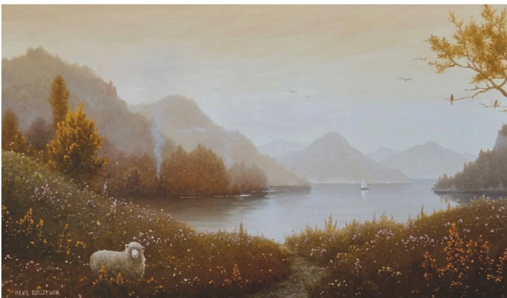
In The Marlborough Sounds. Oil on board, 31 x 52cm