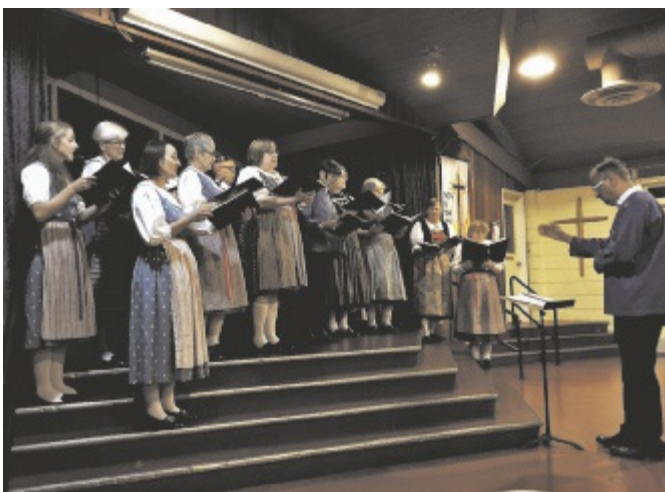
2018 Benefit concert for St. Mary the Virgin, Sapperton, New Westminster, BC

A recent Swiss study concluded that most choirs are overaged and struggle to find new members. In my opinion, the best remedy is to work with 'projects' limited in time and scope. One of our projects is to re-establish an informal men's yodeling group, this time including one or two good women yodelers.